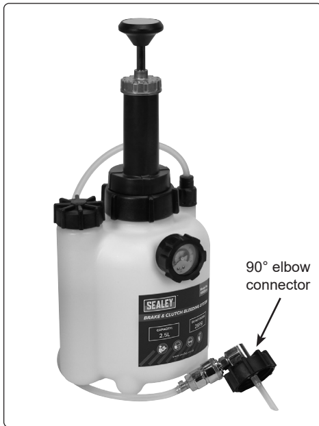
Brake and clutch bleeding system- Model No VS820.V4