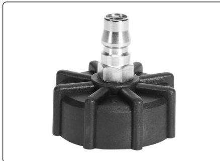
Straight Adaptor - Model No. VS820SA.