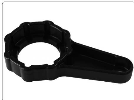
Pump Cap Wrench.