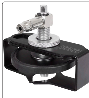
Universal Brake & Clutch Bleeder Adaptor Cap - VS0204UA.V2

Parts support is available for this product. Please email sales@sealey.co.uk or telephone 01284 757500