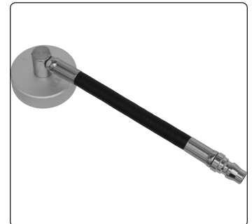
Ø45mm Brake Pressure Bleeder Cap - 90° Connector With Hose. Model No. Model No. VS0204C4